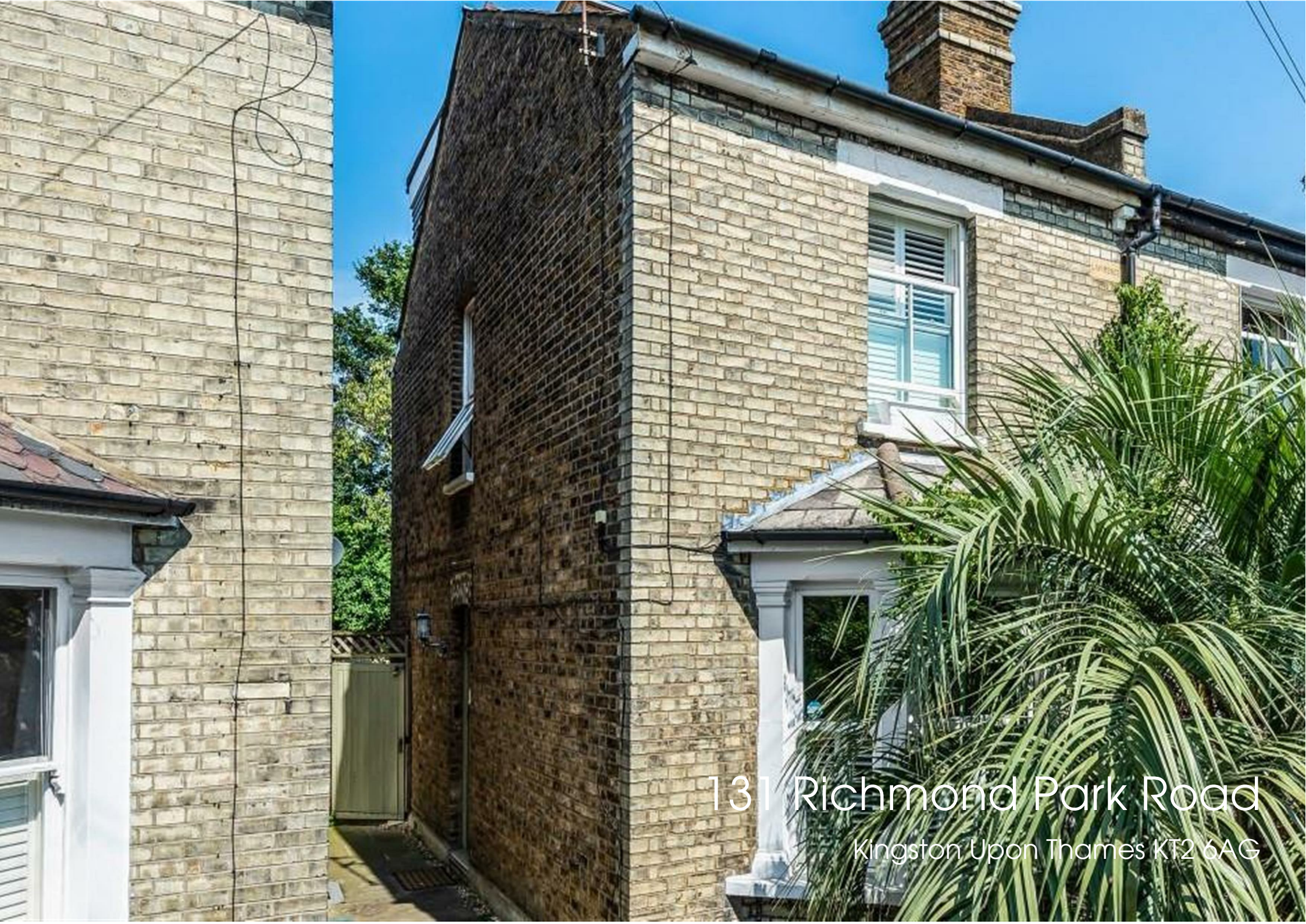
131 Richmond Park Road Kingston Upon Thames KT2 6AG